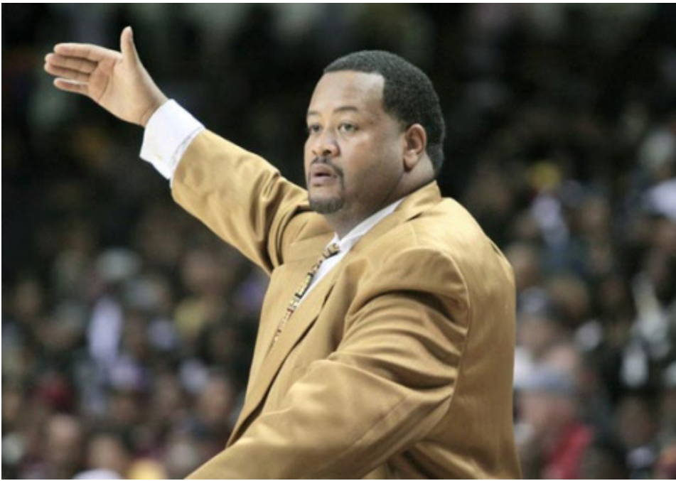
Bill coaching