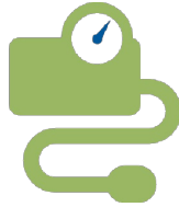
High blood pressure