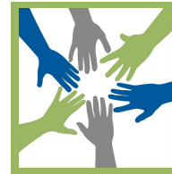
African-American Asian-American Native American Hispanic