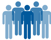
Family history of kidney disease