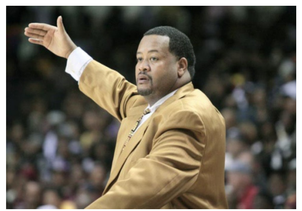
Bill coaching